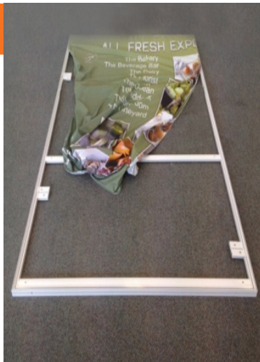
Continue to insert edging around the groove