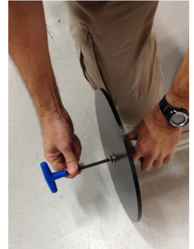
Attach base plate to post