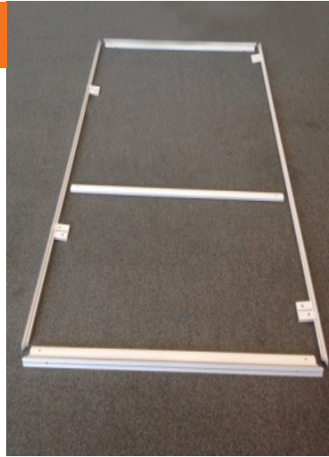
Lay frame out before locking together