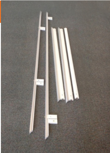
Individual frame components