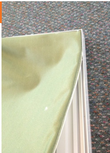
Push silicon edge of fabric panel into