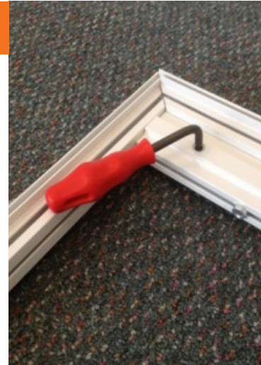
Use allen key to lock frame