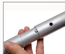
Easy tool free build