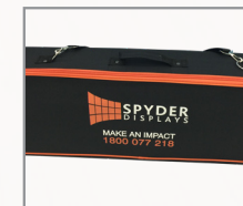
Heavy-duty carry bag