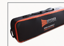
Heavy duty bag